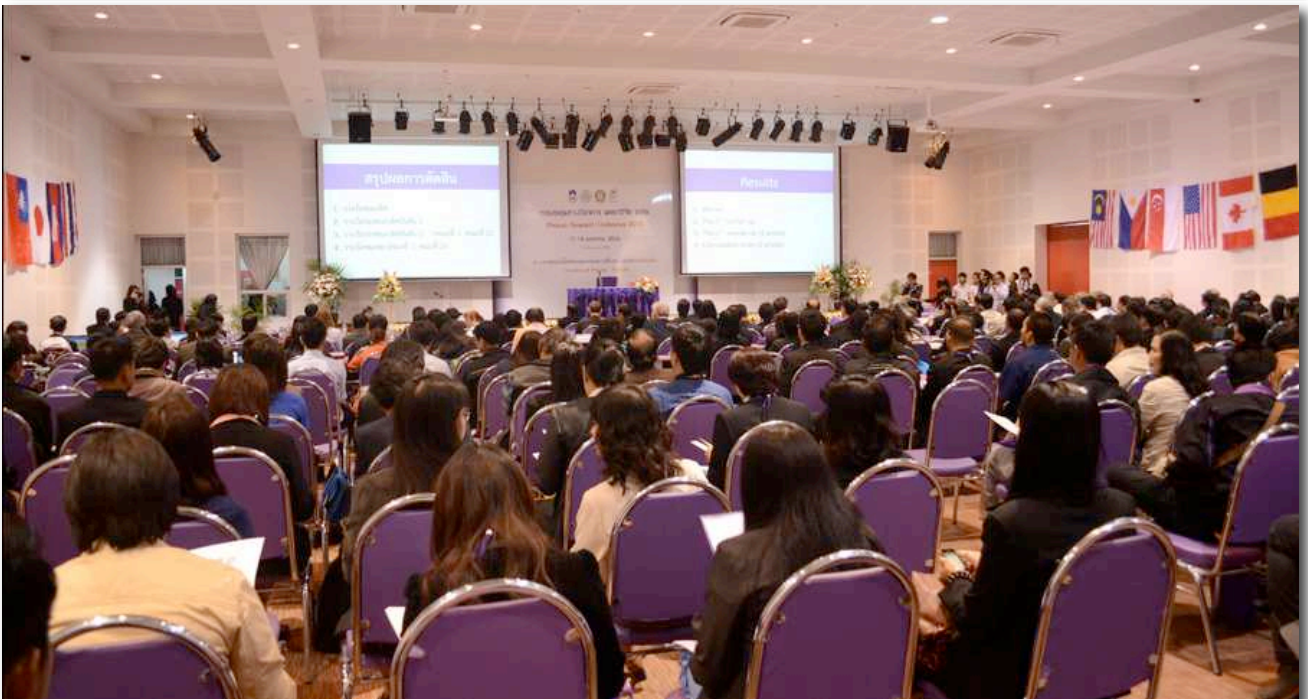
Upper photo: The lovely grouping of yellow and orange marigolds near the stage; Above: The crowd of participants seen from the back of the conference hall